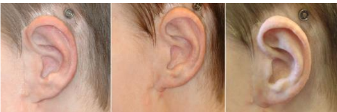
Prosthesis viewed under daylight, tungsten and fluorescent respectively

In combination with our Expert Series Flocks a greater variety of colour textures can be achieved.