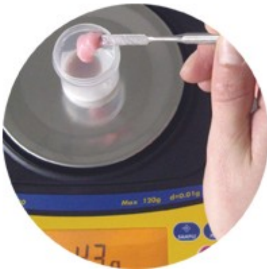
Step 3: Weigh Out