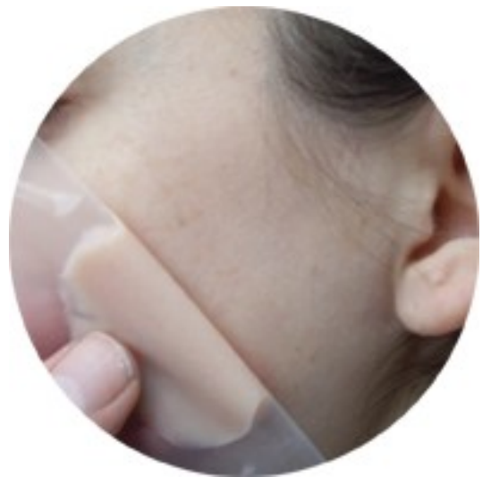
Step 4: Check Colour

Spectromatch Ltd. The Studio 23 Thames Street Hampton Middlesex TW12 2EW Tel: +44 (0) 208 979 0621 Email: sales@spectromatch.com