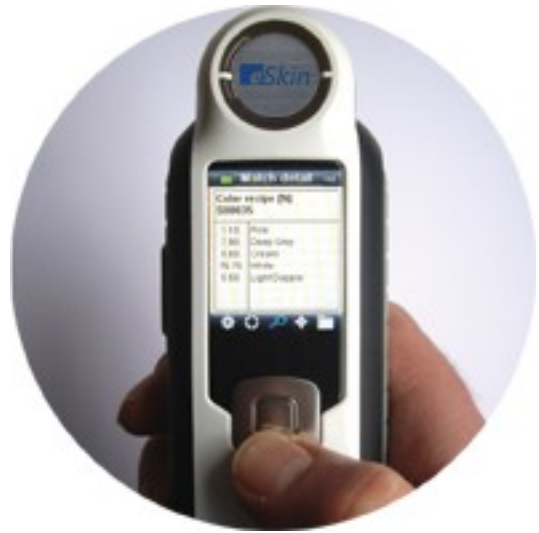
Step 2: Select Recipe