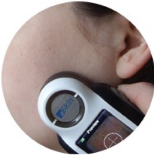
Step 1: Measure Skin

E-Skin is a "single measure and mix" system. The simplicity of the spectroradiometer and ease of use with minimal training make e-Skin the most cost effective digital skin matching solution for today's clinicians.